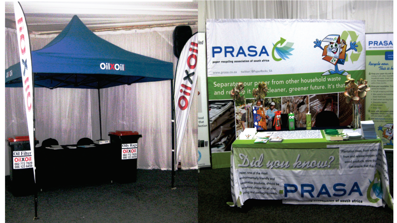
Exhibition Stands at the Environmental Summit.