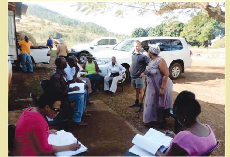
The adjudicating team physically visiting farms nominated for the 2015 FEA.