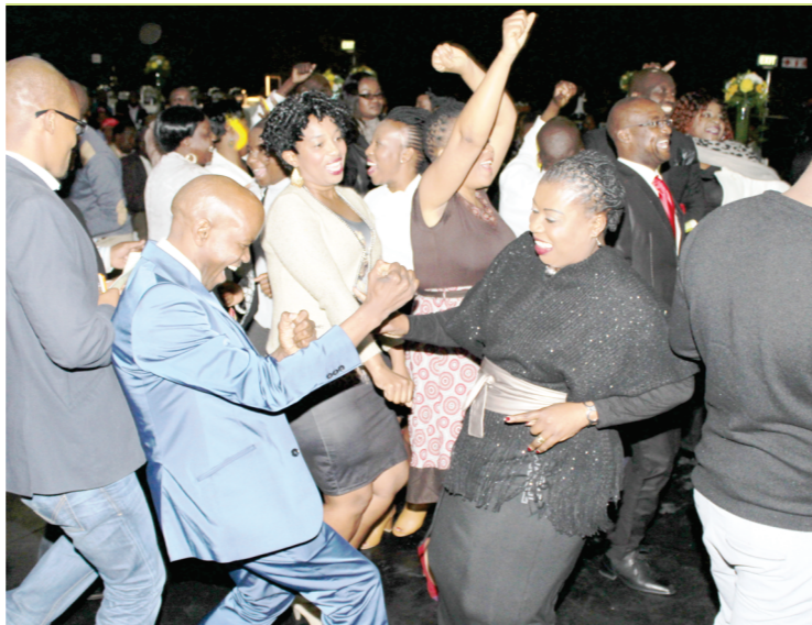
Dardlea colleagues from Nkangala District couldnt contain themselves after the FEA Overall winner was announced.

The initiative is aimed at rewarding the efforts and contribution of women, youth and people with disabilities in matters of food security, job creation, economic growth and poverty alleviation.