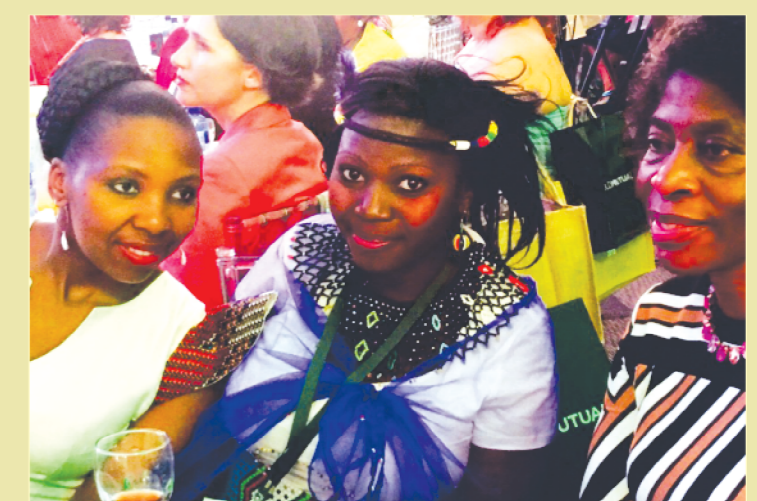
FEA winners representing Mpumalanga in Durban.