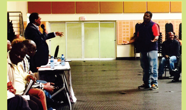
Emotions heating up at a CPA meeting in Nkangala.