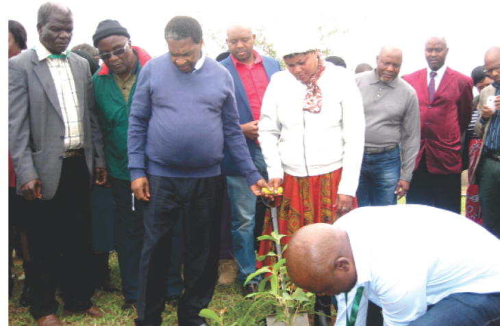
A demonstration to the MEC and the Mayor on how best a tree can be planted while saving water.

The DARDLEA MEC MA Gamede with the different stakeholders attending the event planted 10 trees at the Masibekela Recreational Park. MEC Gamede further handed over 100 indigenous and fruit trees to local schools, clinics and 25 households for planting to alleviate poverty and contribute to food security. Gamede had called on stakeholders to ensure that the partnership and the commitment of government, the private sector and civil society must be sustained in the implementation and management of greening programmes. The National Arbor Week Campaign is celebrated annually from 1 to 7 September.