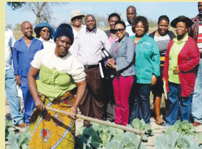
2015 FEA verification and adjudication team on the field.