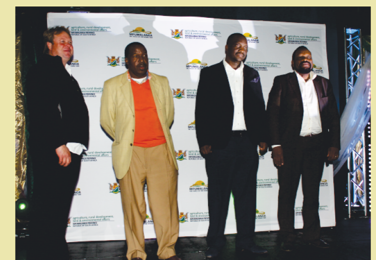
The four main sponsors of the 2015 Provincial FEA were acknowledged.