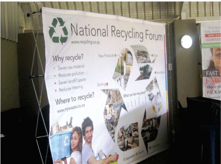
Above and below: Exhibition Stands during Environmental Summit.

But the province faces ever growing pressure on the environment; and if the current challenges are not effectively addressed, they will exacerbate the rate of environmental degradation.