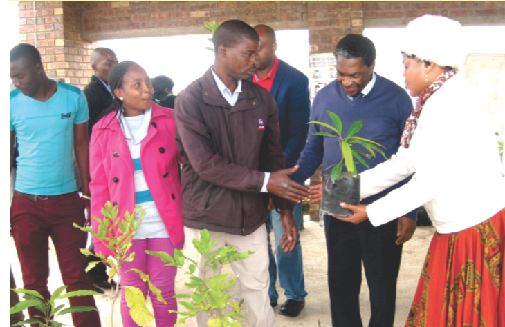
More than a hundred trees were donated to locals to encourage the planting trees.