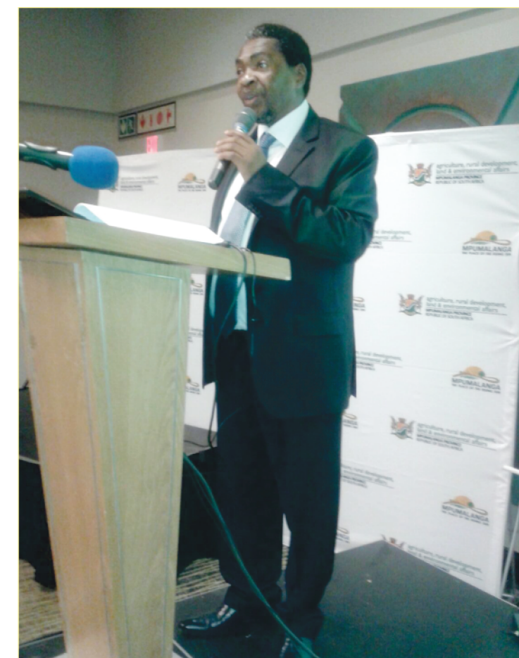
MEC MA Gamede addressing the COP -21 Stakeholder Engagement Workshop in Mbombela.