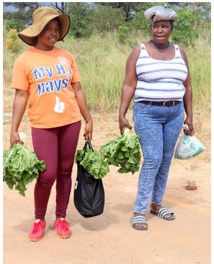
Locals pictured after buying spinach from the Baberton F40 project

Currently the Barberton Fortune 40 project has seven beneficiaries. The total farm size is 20 ha, however the learners are utilizing 10 ha for the production of a variety of crops like spinach, cabbage, chilies and butternut. They have a sustainable market, selling their produce to Pick 'n Pay, Galitos, Spar, Multi Save and the Government Nutrition Programme.