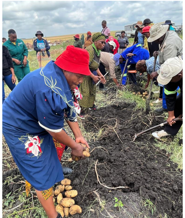
The potatoes are harvested to determine the best cultivar