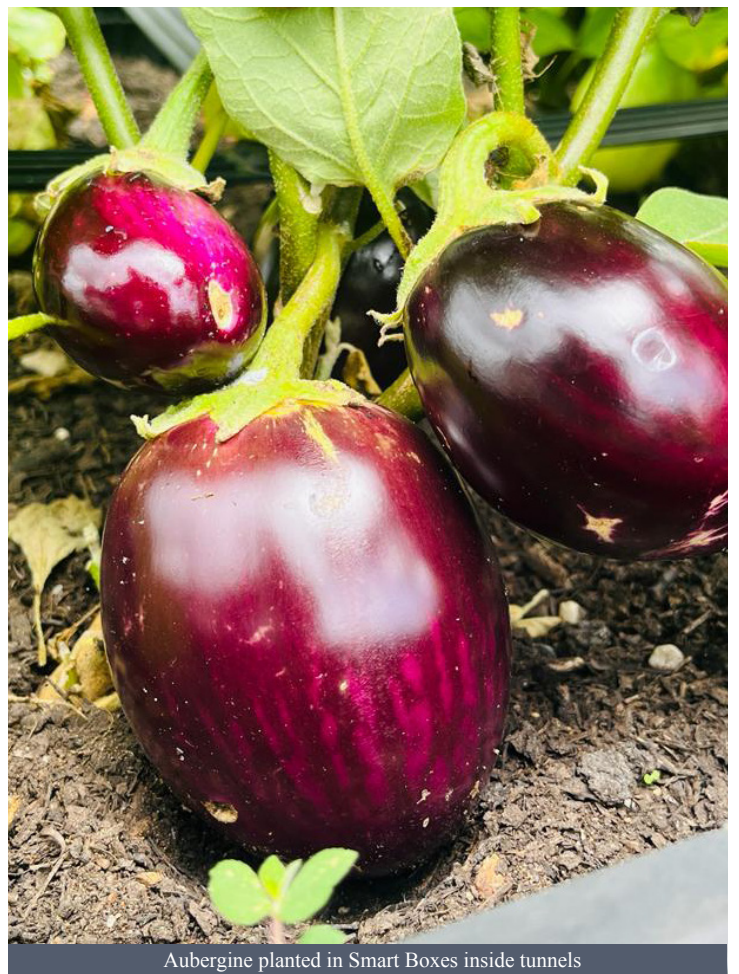
Aubergine planted in Smart Boxes inside tunnels

The Presbyterian Church in Matsulu A, and the Assemblies of God in Elukwatini near Manzana, are some of the churches that received Smart Agriculture Boxes, to assist them in producing vegetables in a Climate Change-friendly and smart way.