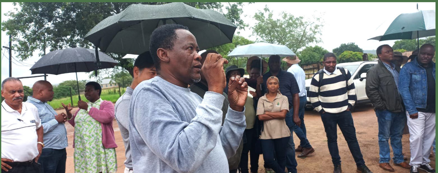
The delegates also went out to visit SHEP projects in Bohlabela

The DARDLEA hosted delegates from Departments of Agriculture from all other eight provinces, for a two-day Public Sector Forum for Extension and Advisory Services in Hazyview in