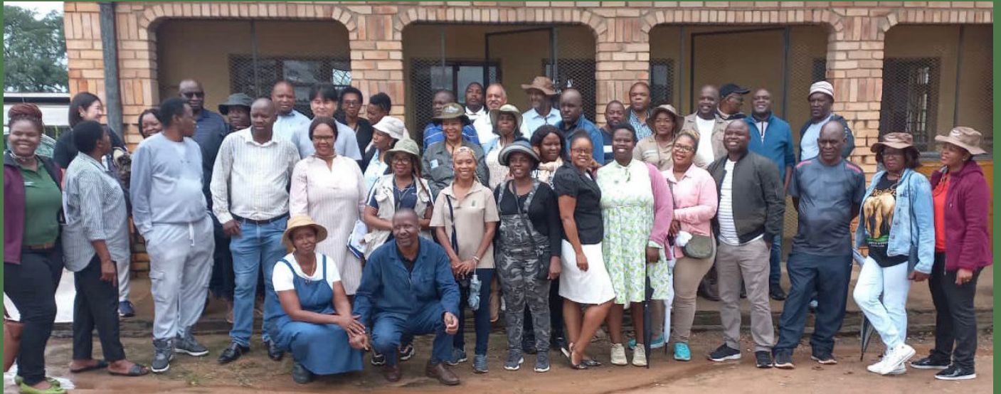
Public Sector Forum for Extension and Advisory Services attendees in a group picture

SACNASP as a professional body that deals with recruiting and registering all Agricultural practitioner, encouraging them to attend symposiums, workshops and conferences to help them with their grading.