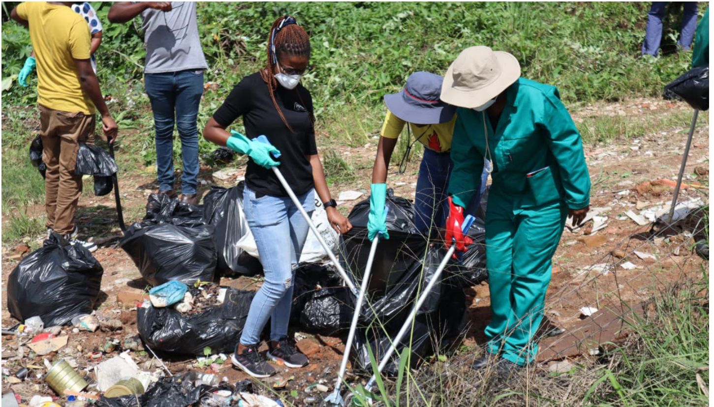
Locals and government officials during a cleanup in Mataffin

Communities are urged to stop creating illegal dumping sites. The DARDLEA's Environmental Services team collaborated with the City of Mbombela Municipality and other key stakeholders to raise awareness about the benefits of preserving Wetlands and Grasslands. The awareness campaign, held in February in Mataffin outside Mbombela, also dealt with major threats that degrades Mpumalanga's wetlands and grasslands.