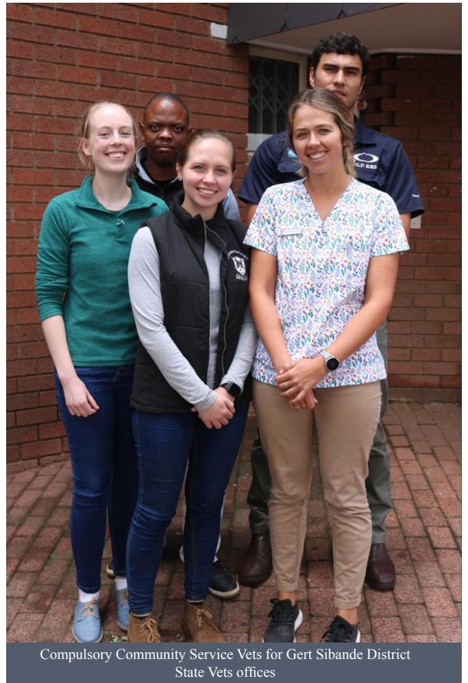
Compulsory Community Service Vets for Gert Sibande District State Vets offices

25 young Veterinarians, who just completed at the Onderstepoort Veterinary Institute of the University of Pretoria, have been placed in State Vet Offices throughout Mpumalanga on a 12-month long contract. The Vets, who are already on the ground, are servicing all municipalities, rendering animal health services to both pets and livestock.