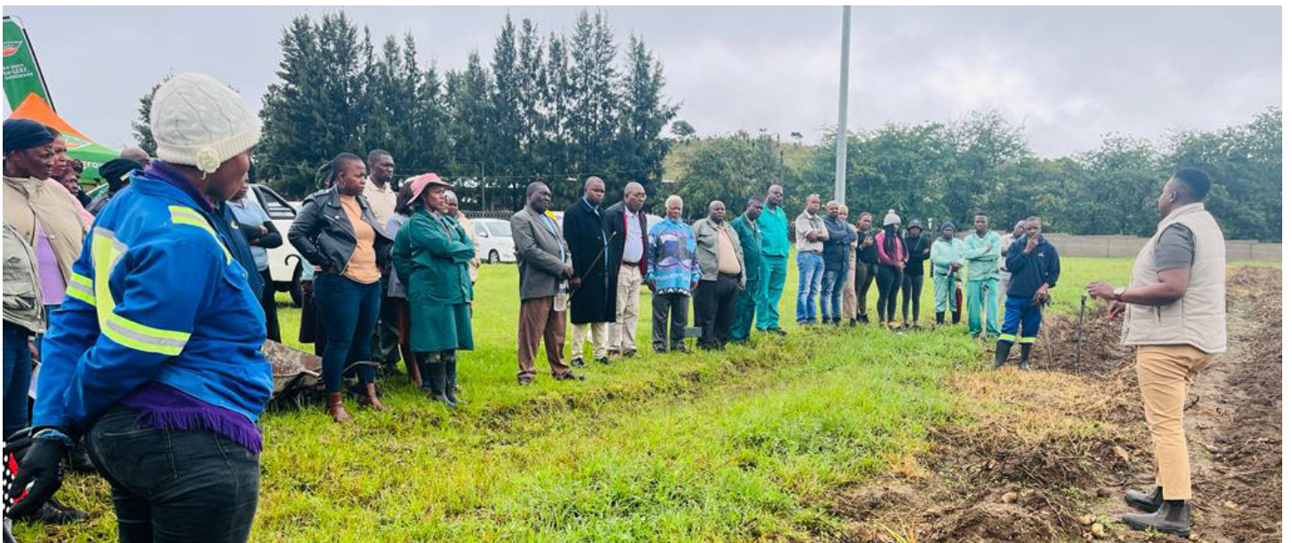
Briefing and discussion on the cultivars and harvest