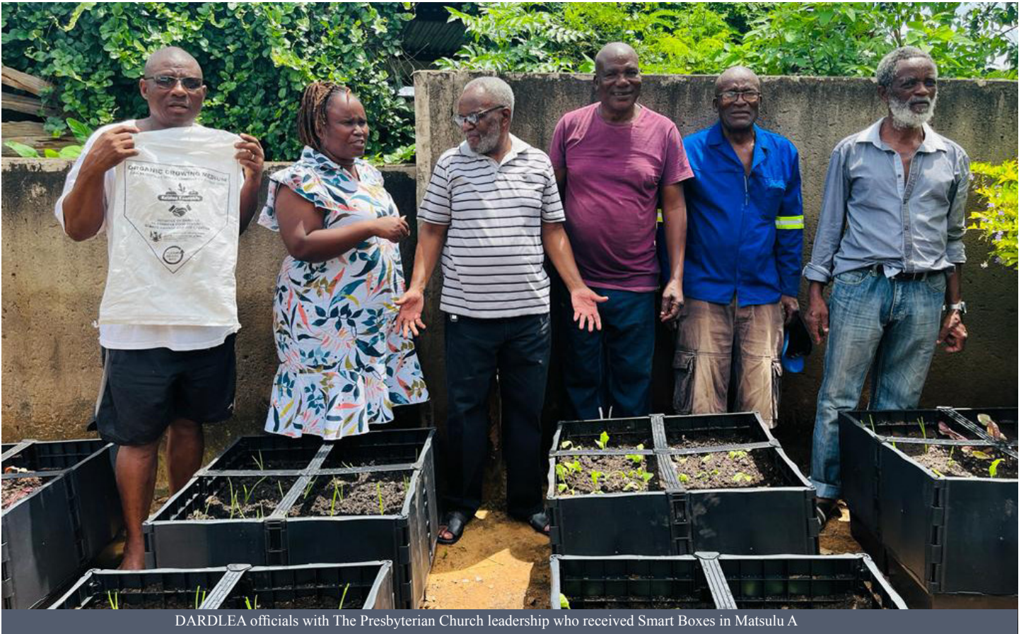
DARDLEA officials with The Presbyterian Church leadership who received Smart Boxes in Matsulu A

Testing the effectiveness of the Smart Agriculture Box inside Tunnels at the Amsterdam Environmental Centre has proven to be a fruitful exercise. This after vegetables planted about in January 2023, using the organic compost produced at the centre, looked amazingly healthy, with no pests whatsoever, a month after they were planted. This can safely lead to a conclusion that these Climate Change-friendly Boxes also produce amazing yields inside Tunnels.