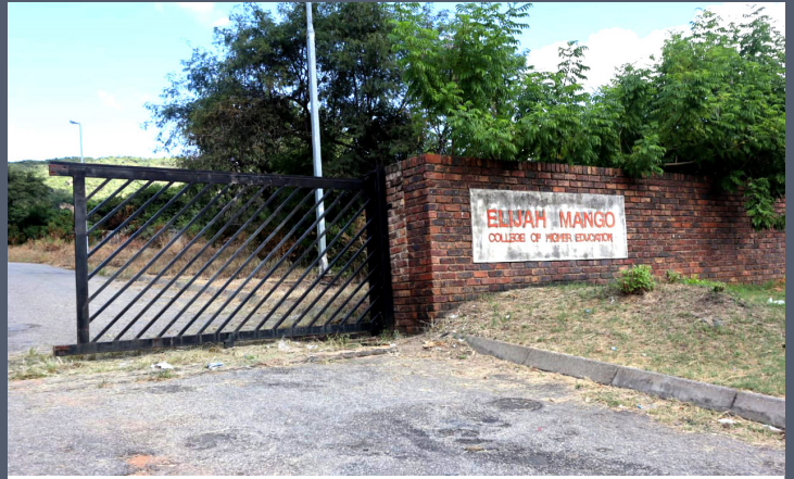
An entrance to Elijah Mango College

Elijah Mango College produced thousands of qualified teachers during the former KaNgwane Homeland, but became dilapidated due to vandalism and theft, after it was closed down.