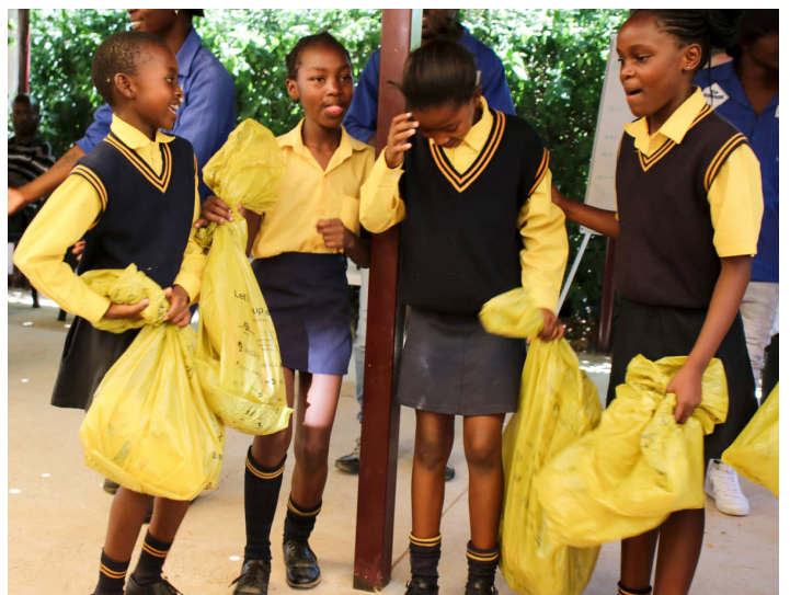
Kgantsho Primary School learners who were part of the workshop on recycling and waste management

have since been erected to try and stop the illegal dumping scourge.