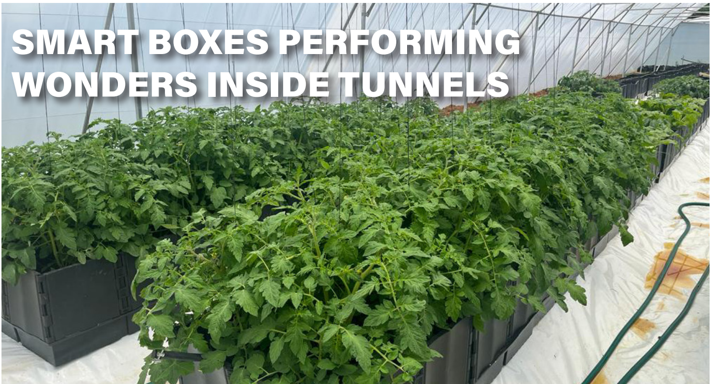
The good quality products planted in Smart Agriculture boxes inside Tunnels