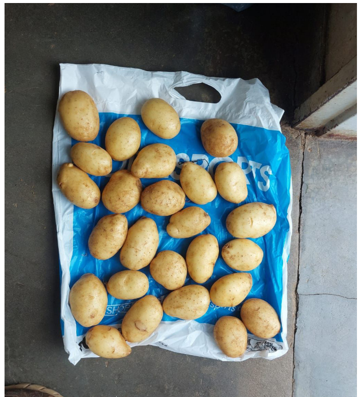
The good quality potatoes produced at Kagiso's project

Launched in 2015, the Fortune 40 Program aims to equip young wanna-be farmers with mentorship and farming skills that will ensure that once they are done, they can be their own bosses and run their own successful projects.